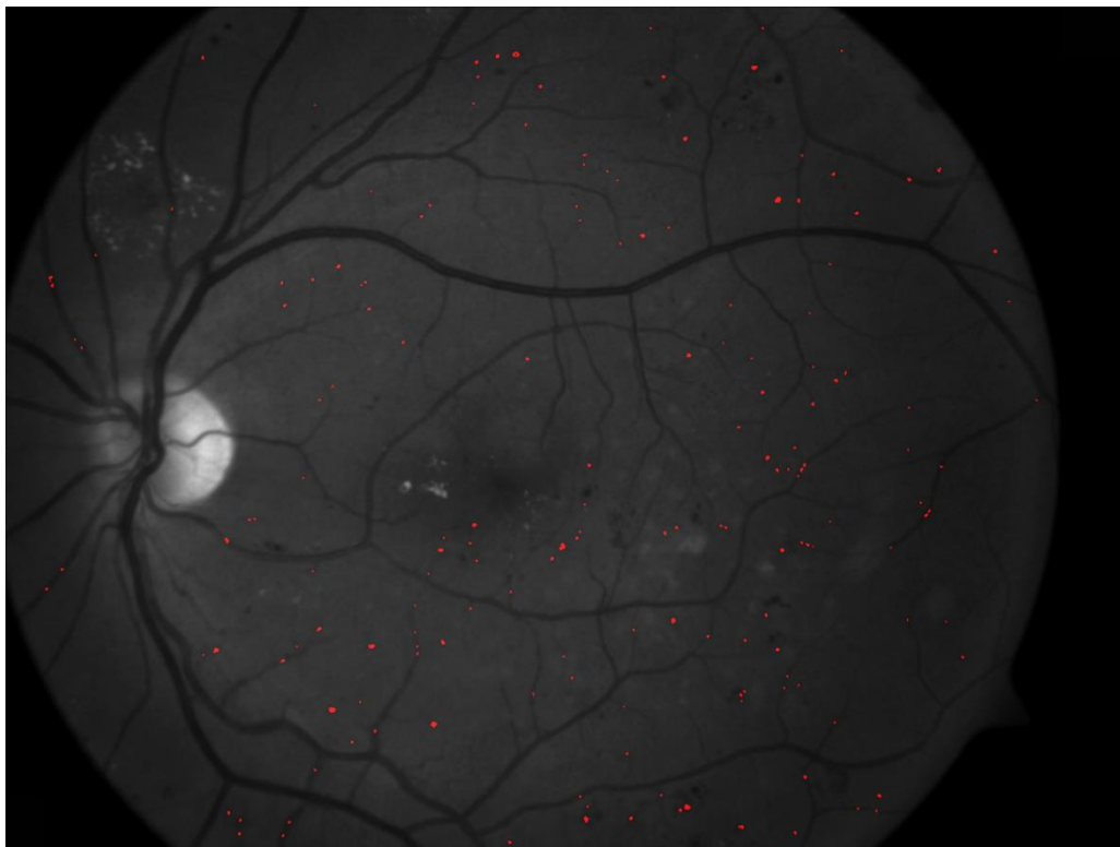
Figure 3. A sample result image