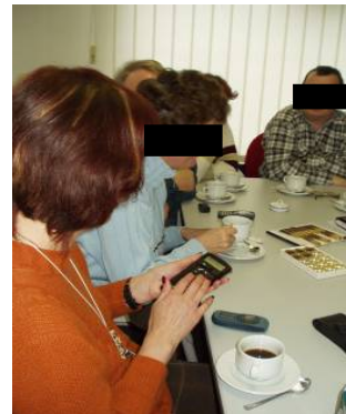
Figure 2: Interrogation of experts about user habits and design deficits of electronic devices for blinds

The main scope of interrogations was on the level of operating knowledge with IT-devices, experienced and known problems during vacations or in a tourist environment, common used aids for their special