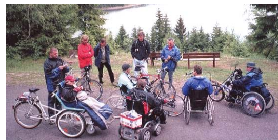
Figure 3: On-site inspection to determine the outdoor routes and classification of their obstacles

To audit and complement the results of these interrogations some on-site inspections take place with potential users from the focused handicapped groups like is to be seen in fig. 3. At these inspection tours the feasible routes with the occurring obstacles were determined.