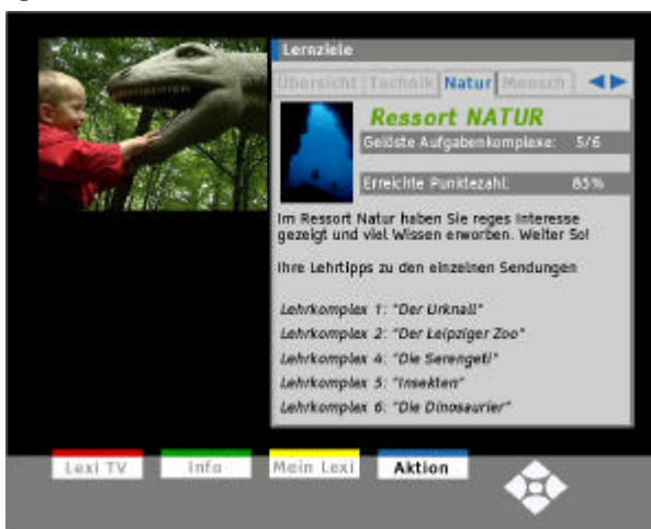
Figure 5. Individual learning control