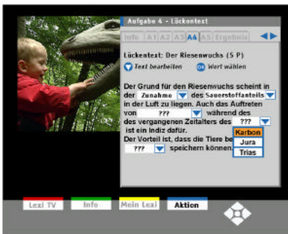
Figure 4. Gap-text with pull-down menus with three options each