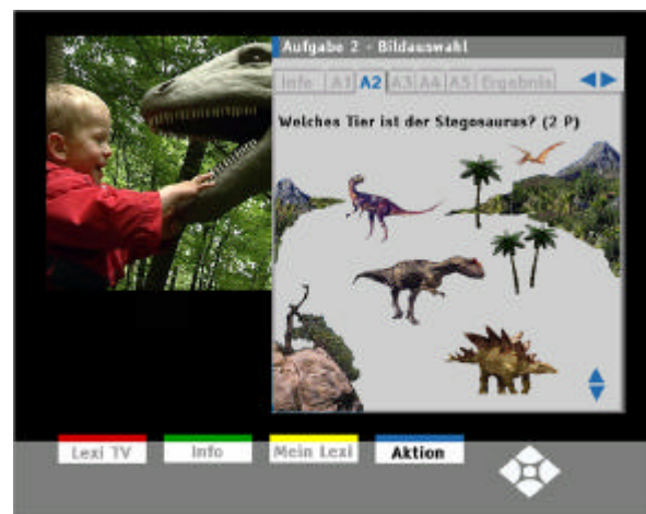
Figure 2. Multiple choice question with images and animations

The following question types have been designed, implemented and evaluated: Multiple choice quiz (text), multiple choice (images and animations), allocation of words to images in a specific order, gap-text with pull-down menus and an individual learning control: